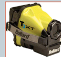
Thermal Imaging Camera — $10,000