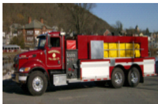
New Engine-Tanker delivered in March of 2009. A federal grant paid $90,000 of the total cost of $190,000.

Whether it was a structure fire or a motor vehicle accident, the Whitehall Volunteer Fire Company's Firefighter Donation Program provides an opportunity to say "thanks" in a way that will ensure members of our community