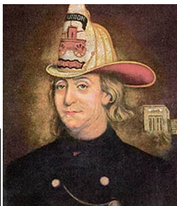
1736—The Union Fire Company was the first organized volunteer fire

when Ben Franklin formed the first volunteer fire company in Philadelphia.